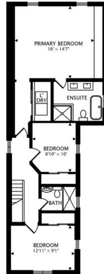
SECOND 945 sq ft